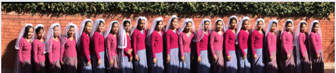
Lydia Vocational Training Centre Ladies