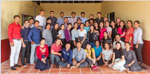
Chab Dai Staff

Girls and women in many countries are often viewed and treated as second class citizens. Whilst the attitude is changing in a lot of urban centres, in many rural communities, these views still persist. Many families view educating women as unnecessary and are therefore unwilling to spend money on formal education for their daughters. Often women are instead expected to begin work or marry and begin a family at a young age. As a result, many of these women have only basic levels of education. With a lack of education some are sold into slavery, some resort to prostitution and others beg, just to feed their children.